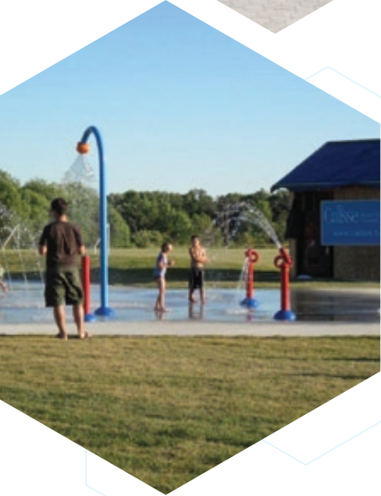
Photos this page (top to bottom): Community BBQ on opening day at 205 Provencher; Waterpark opens in Lorette, August 2011.